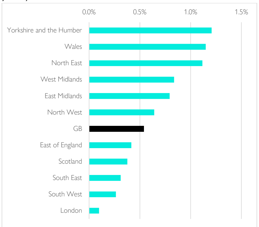
Figure 2: Employment in emissions intensive heavy industry by region (RSA analysis of Business Register and Employment Survey 2019)

Port Talbot, which is home to the UK's largest steelworks, ranks top. In second place is North Lincolnshire, which is where UK's other major steelworks is located (Scunthorpe). Clackmannanshire has a small cluster of glass manufacturing. While Stoke-on-Trent is a centre of ceramics.